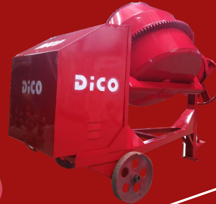
Molen Semen Cement Mixers

DICO supplies a range of spare parts for sand pumps and agricultural equipment — including bearings, shafts, impellers, and elbow pipes — ensuring dimensional consistency, field compatibility, and minimal operational downtime.