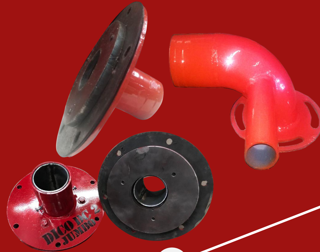
Suku Cadang Spare Parts

Built for continuous heavy-duty operation in mining and dredging environments, handling high-volume slurry and sand transfer in demanding field conditions.