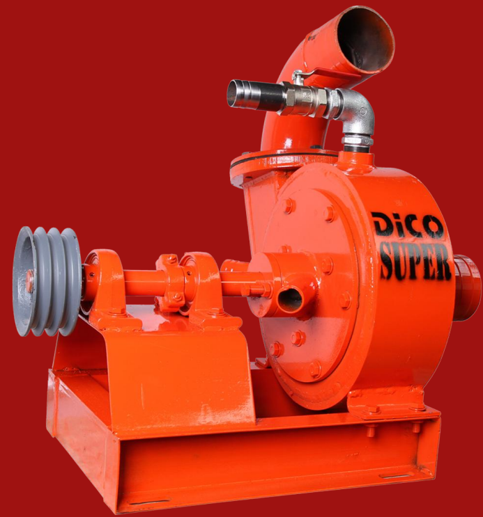
Pompa Pasir Sand Pumps

Built for continuous heavy-duty operation in mining and dredging environments, handling high-volume slurry and sand transfer in demanding field conditions.