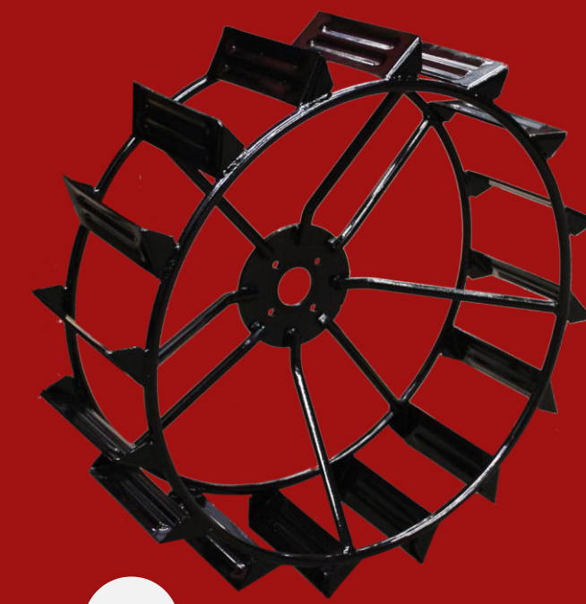
Roda Traktor Tractor Wheels

Durable cement mixers built for consistent mixing performance on active construction sites, fabricated to withstand the rigors of daily field use.